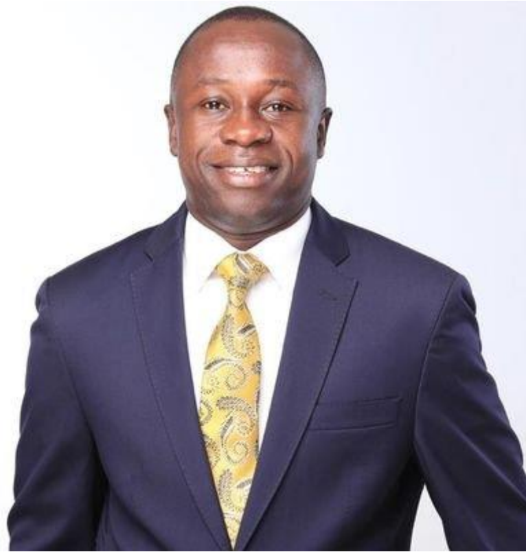
Hon. Peter Ogwang Minister of State for Sports CHIEF GUEST